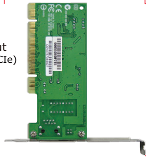
PCI Input (Optional PCIe)