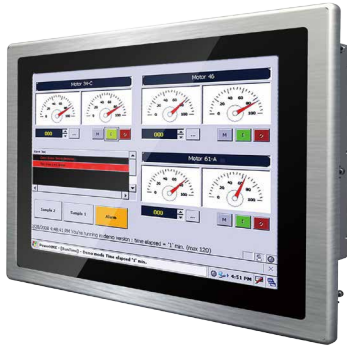
Real Flat Panel Mount (IP65 front side)