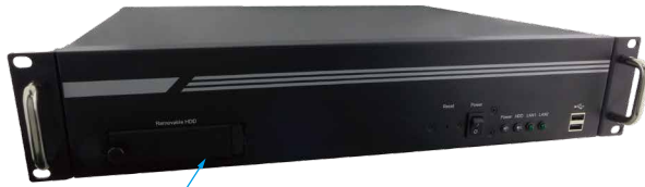
2 x Removable 2.5" Drive Bay