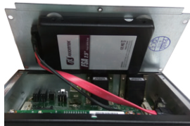
Easy storage maintenance