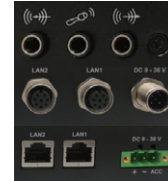
Optional I/O ports for audio, LAN jack type and DC-in jack type