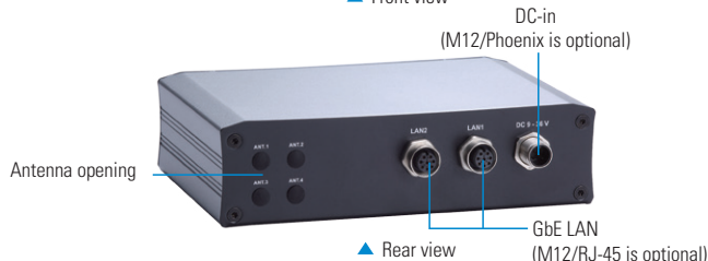
DC-in (M12/Phoenix is optional)