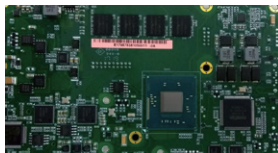
Onboard processor and system memory for great reliability and stability