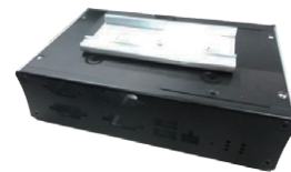
DIN-rail, wall mount supported for various applications, without space limitation