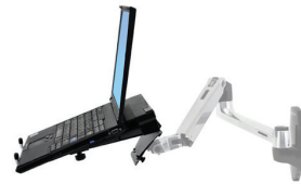
Attach a laptop to an LX Desk or Wall Mount Arm with Notebook Tray accessory #50-193-200