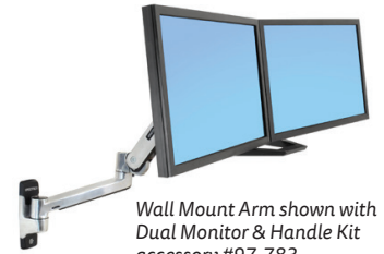
Wall Mount Arm shown with Dual Monitor & Handle Kit accessory #97-783

Attaches directly to sturdy vertical surfaces. Where applicable, install to wood stud. (Fasteners for direct attachment to wood studs or concrete surfaces are included.)