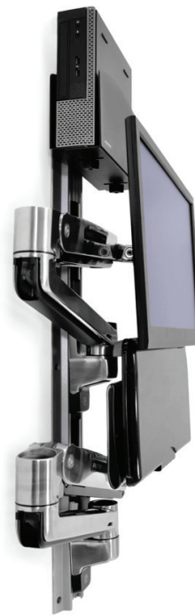
LX Sit-Stand Wall Mount System shown with Medium CPU Holder

LX Sit-Stand Wall Mount System: Keyboard folds to within 6.8" (17,3 cm) of wall in storage position; LCD arm folds back to a depth of 5.5" (14 cm)