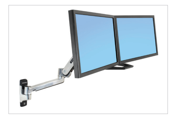
Dual Monitor & Handle Kit (#97-783) is the perfect dual-mounting solution for monitors 17" to 24"; the handle makes it easy to reposition screens