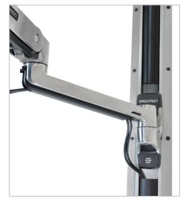
Recommended: Attach Wall Mount Arm to an Ergotron Wall Track using bracket (#97-091)