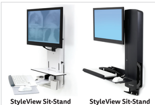
yleView Sit-Stand Vertical Lift Patient Room